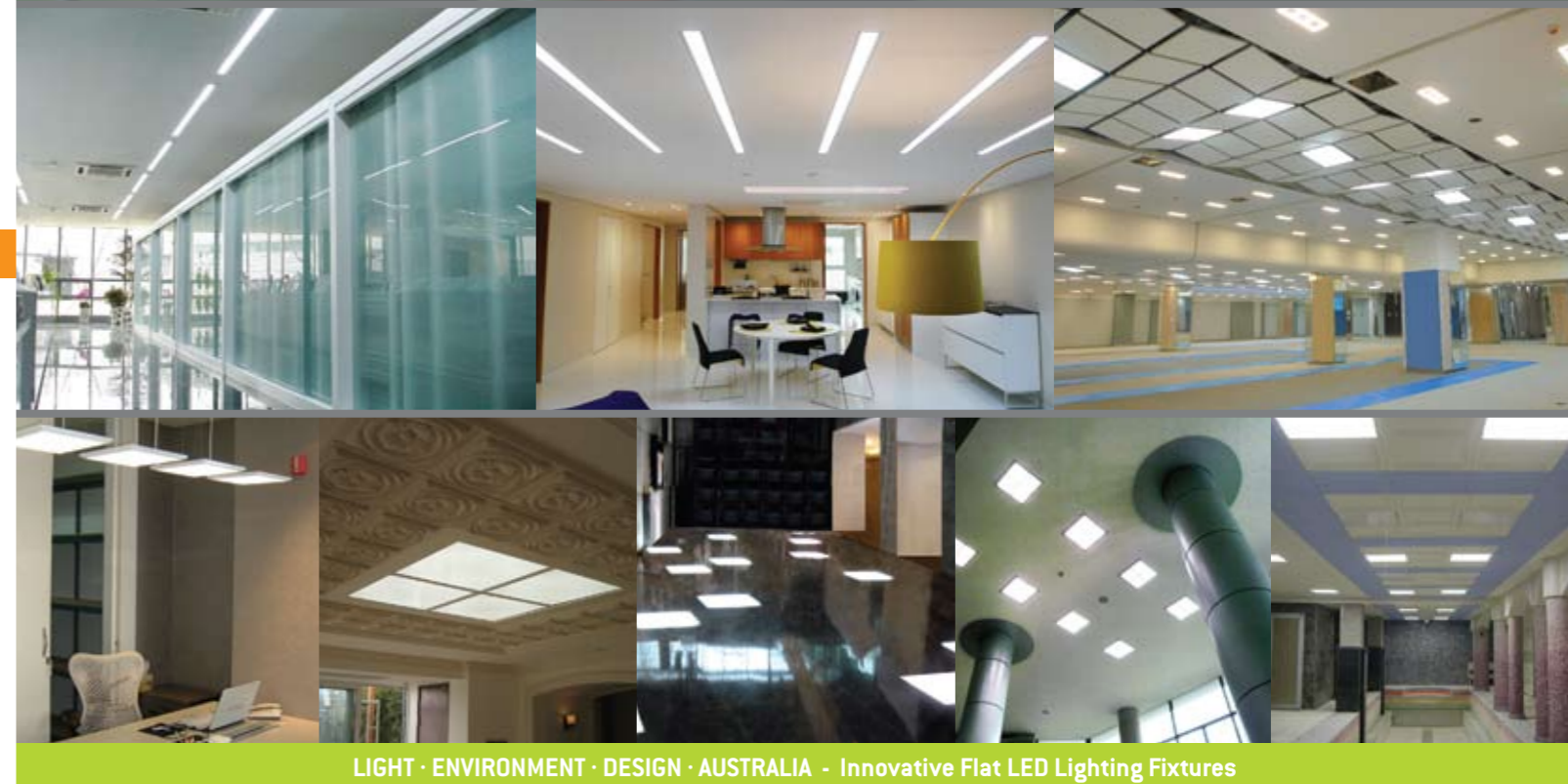
LIGHT · ENVIRONMENT · DESIGN · AUSTRALIA - Innovative Flat LED Lighting Fixtures