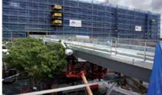
Sydney International Airport - ABI Group