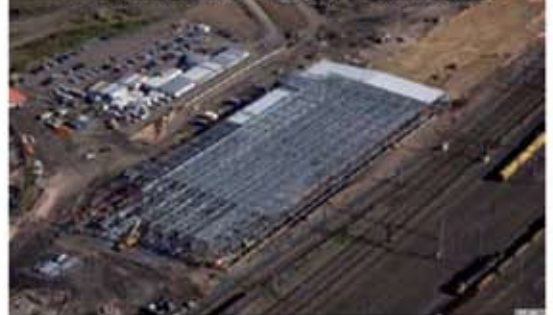
Auburn Maintenance Facility - John Holland