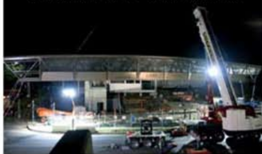
LCT Phoenix St Bridge - Theiss John Holland