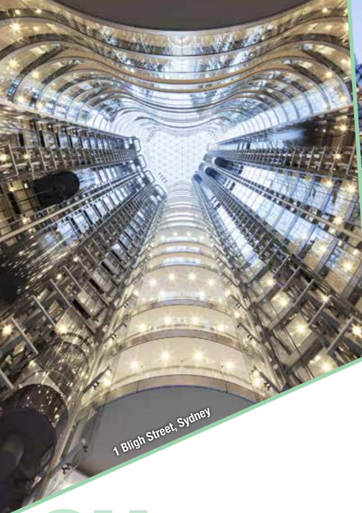
1 Bligh Street, Sydney