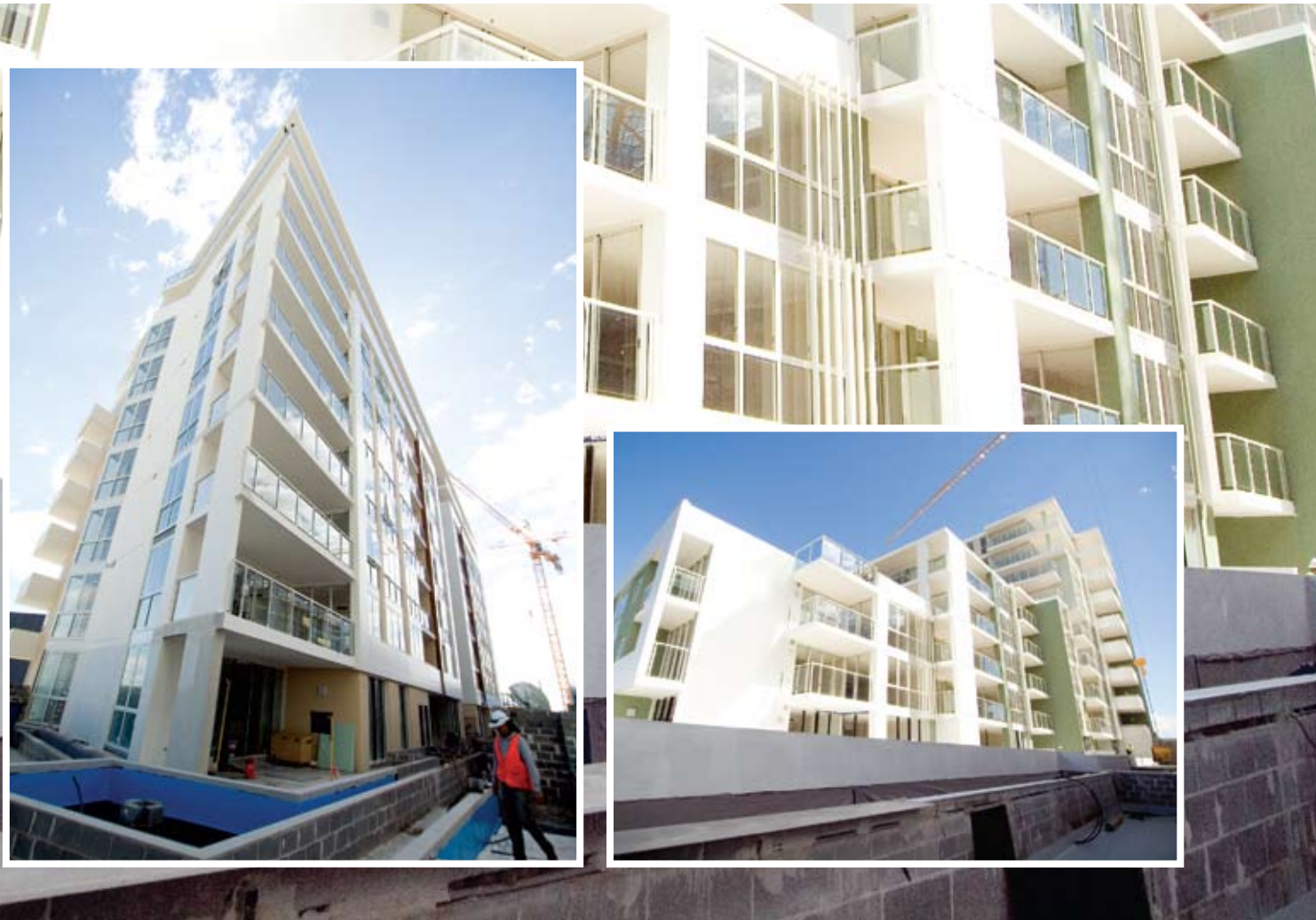
Below Proactive Bricklaying were responsible for block and brick work on floors, basements and carparks.