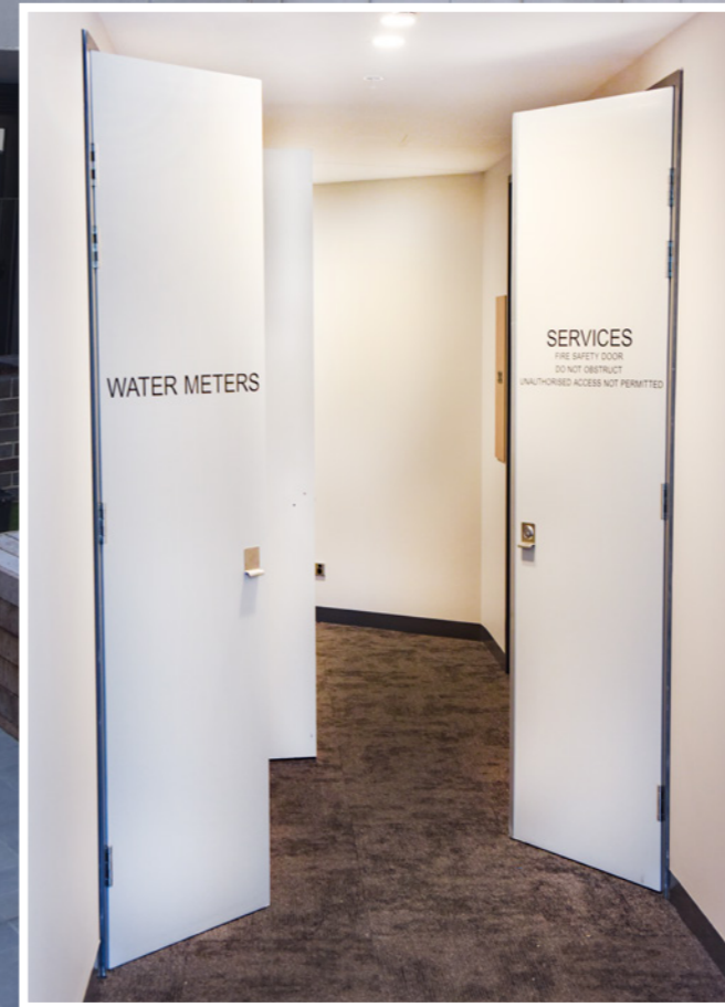
Below Barzen Carpentry installed a range of fire rated doors throughout the development.