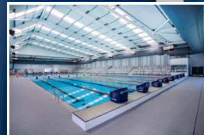
Gippsland Regional Aquatic Centre, Victoria

Close Commercial Services are a Melbourne based specialist roofing subcontractor. For the Gippsland Regional Aquatic Centre, they supplied and installed Kingspan roof, Kingspan wall, EEFAS skylight systems, polycarbonate cladding and flashings to make the roof and façade meet airtight requirements.