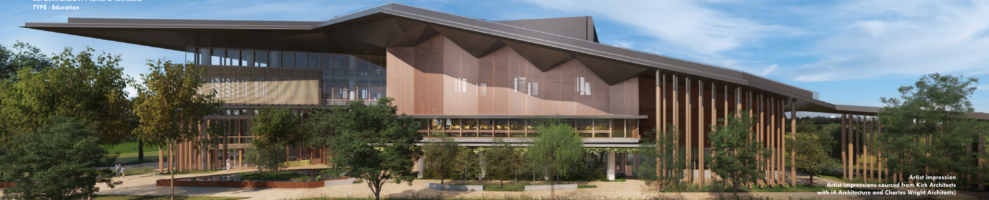
Artist impression

CLIENT : James Cook University MAIN CONSTRUCTION COMPANY : BESIX Watpac ARCHITECT : Richard Kirk Architect Pty Ltd with i4architecture & Charles Wright Architects SUPERINTENDENT : Turner & Townsend TYPE : Education