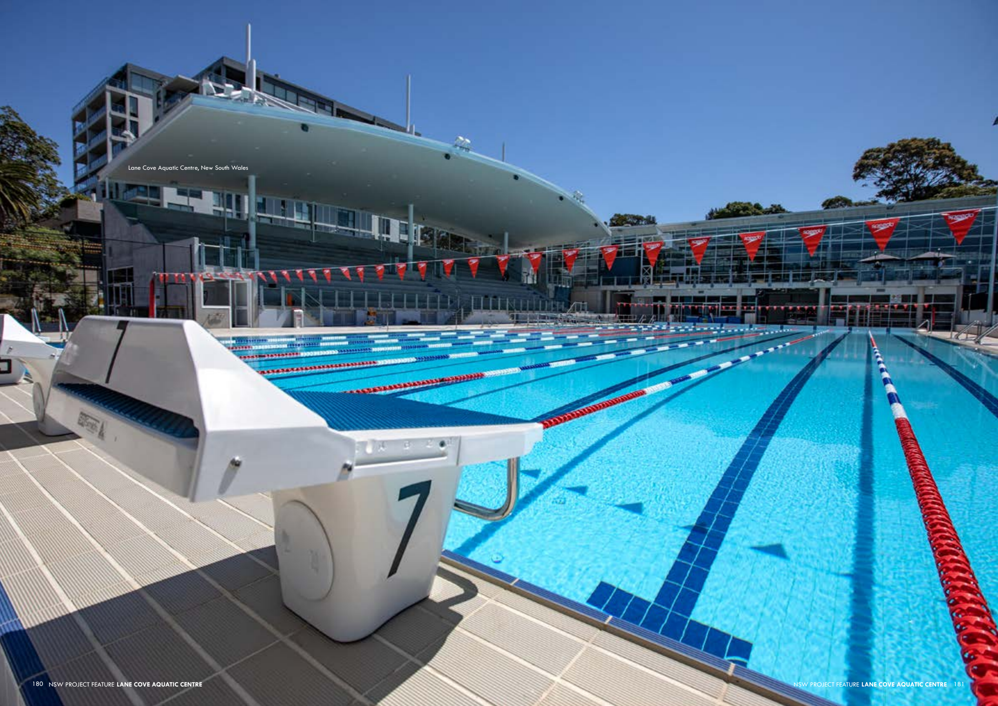
Lane Cove Aquatic Centre, New South Wales