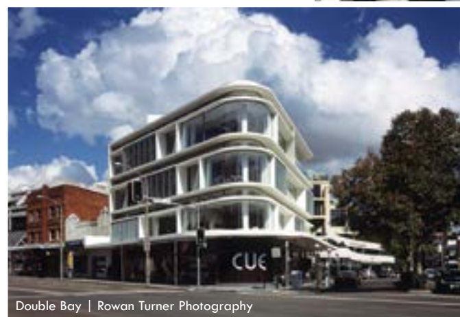
Double Bay