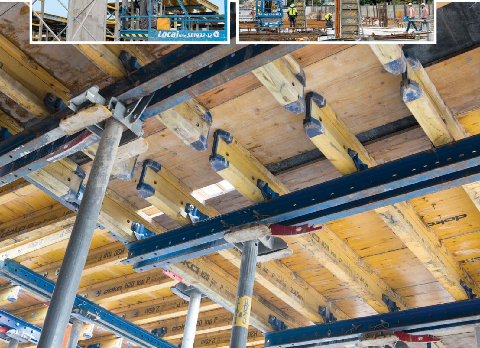
Newstead Series, Queensland