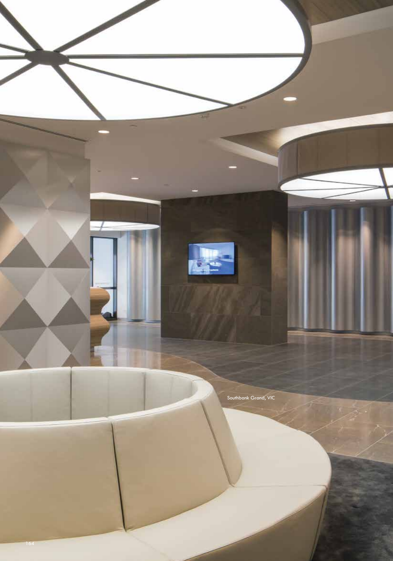
Southbank Grand, VIC