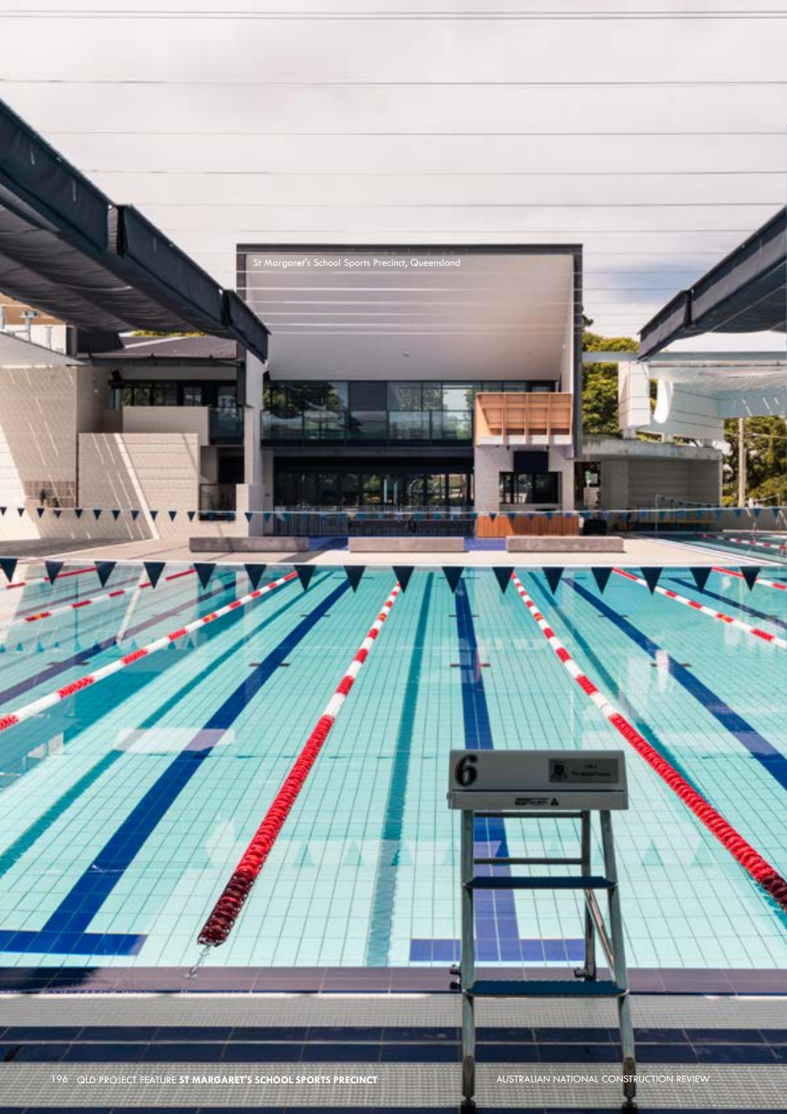
St Margaret's School Sports Precinct, Queensland

Below Eastman Group completed all the tiling works for the bathrooms, pool surrounds, platforms and general tiling.