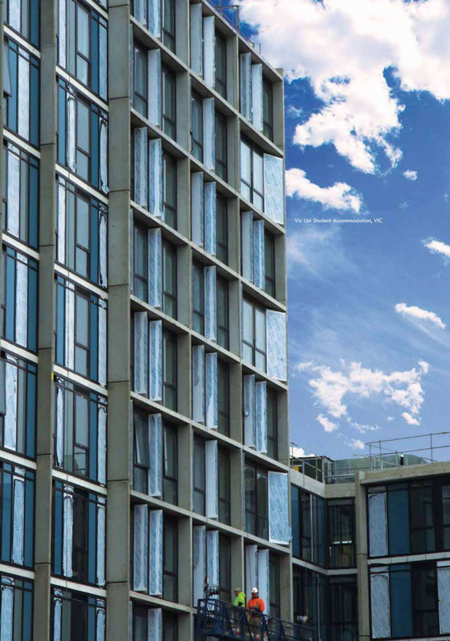
Vic Uni Student Accommodation, VIC