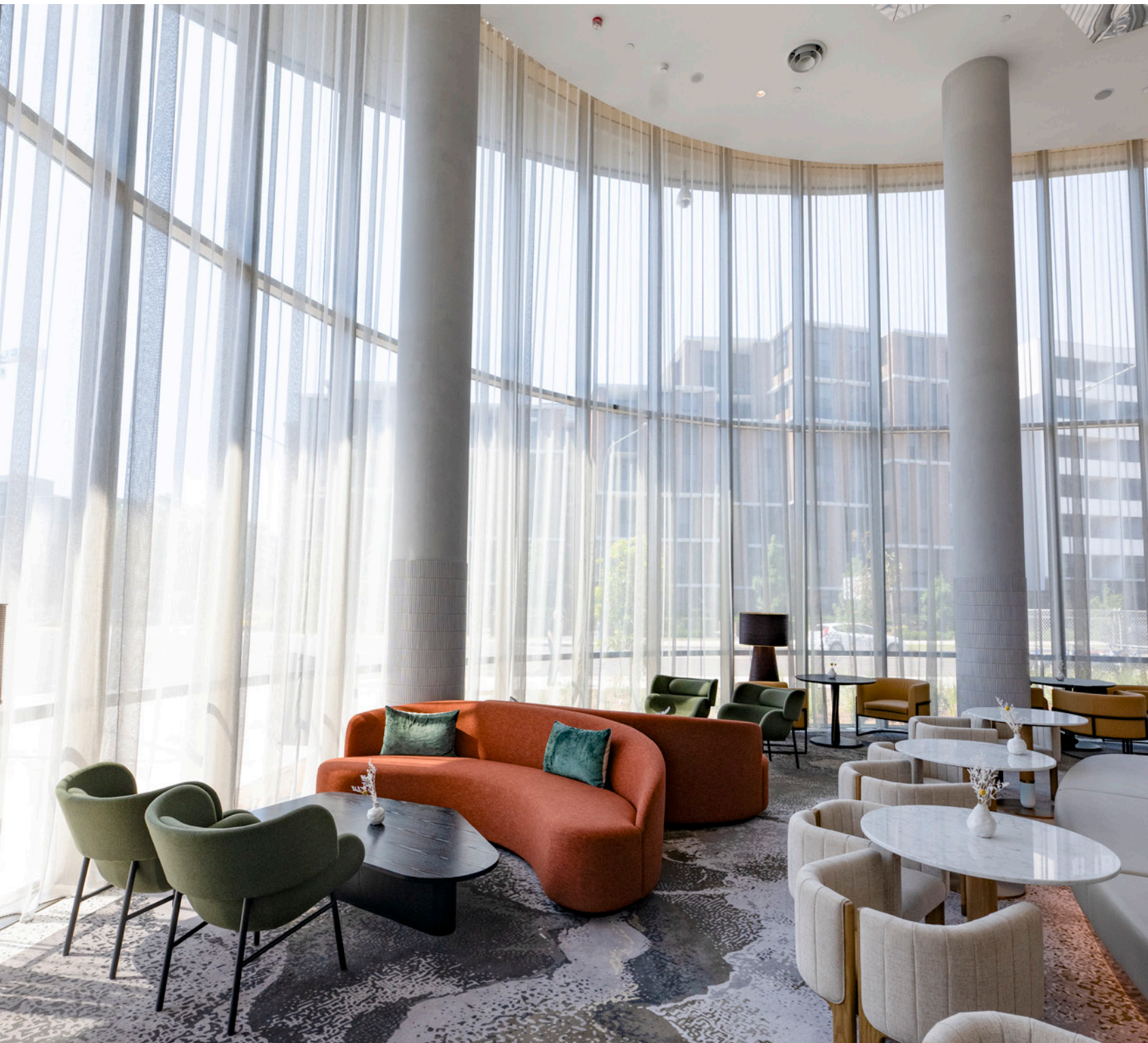
Below REILLYS manufactured over 4,000m of fabric to complete the 160 hotel rooms' curtains, all whilst custom curving double curtain tracks onsite to suit the curved detail of the façade.

World-class projects like the Western Sydney Conference Centre and Pullman Sydney Penrith require world-class window furnishings. REILLYS, a family-owned and operated business specialising in window and soft furnishings, were contracted to complete all the window coverings throughout the conference centre and hotel. They even installed traditional window coverings in non-traditional ways, to divide space.