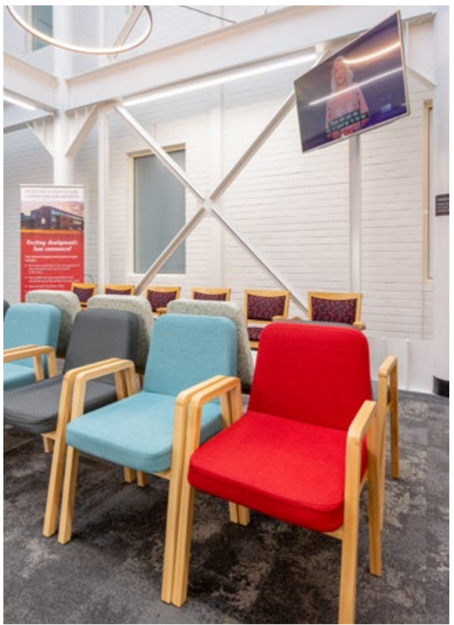
Below Workspace Commercial Furniture manufactured and installed chairs, office desks and workstations.

G & G Tiling specialise in the supply and installation of tiles for commercial and industrial applications. At Ashford Hospital the company had a team of 10 laying floor and wall tiles in the entry foyer, day surgery rooms and ensuites.