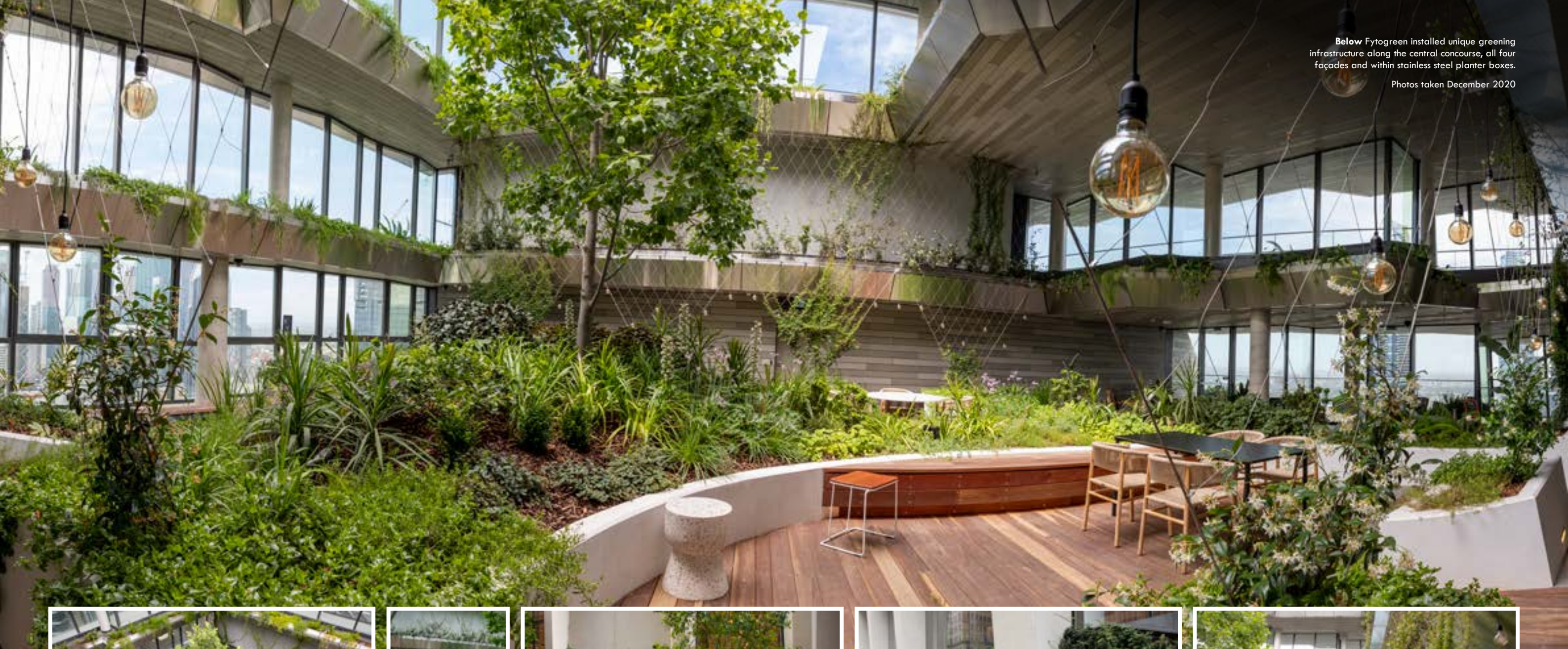
Below Fytogreen installed unique greening infrastructure along the central concourse, all four façades and within stainless steel planter boxes.