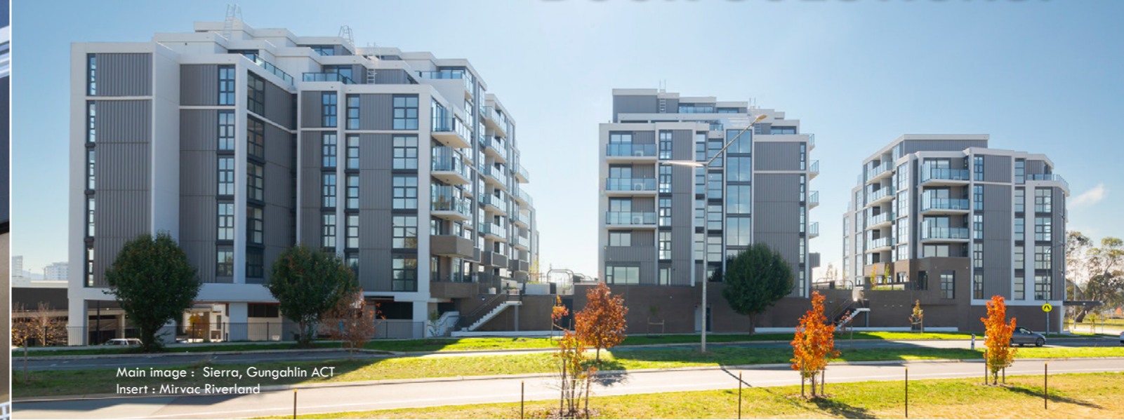
Main image : Sierra, Gungahlin ACT Insert : Mirvac Riverland