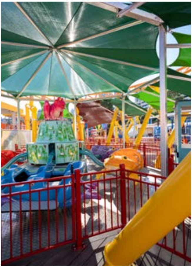
Below Northern Fencing Specialists manufactured and installed tubular powder coated fencing and chain wire throughout the park.