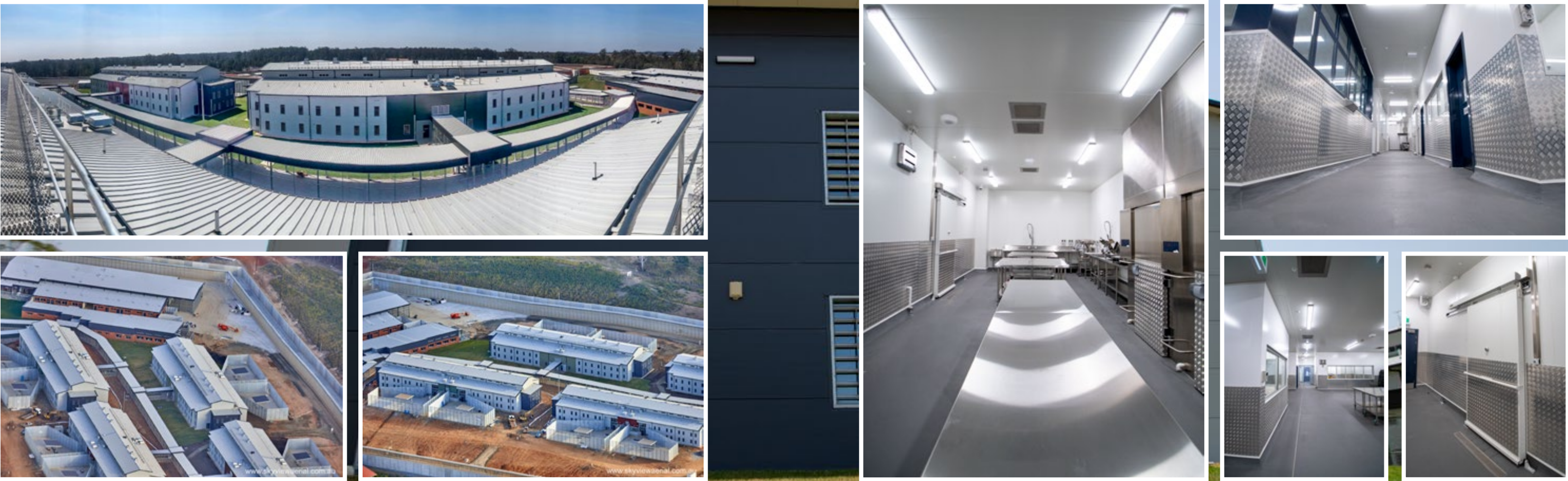
Below BAVAP installed non-slip flooring and waterproofing to the kitchen and coolroom areas.

As a leading nationwide provider of metal roofing services, Australia Wide Roofing’s team of experienced professionals uses quality materials from trusted suppliers to deliver roofing systems that will pass the test of time.