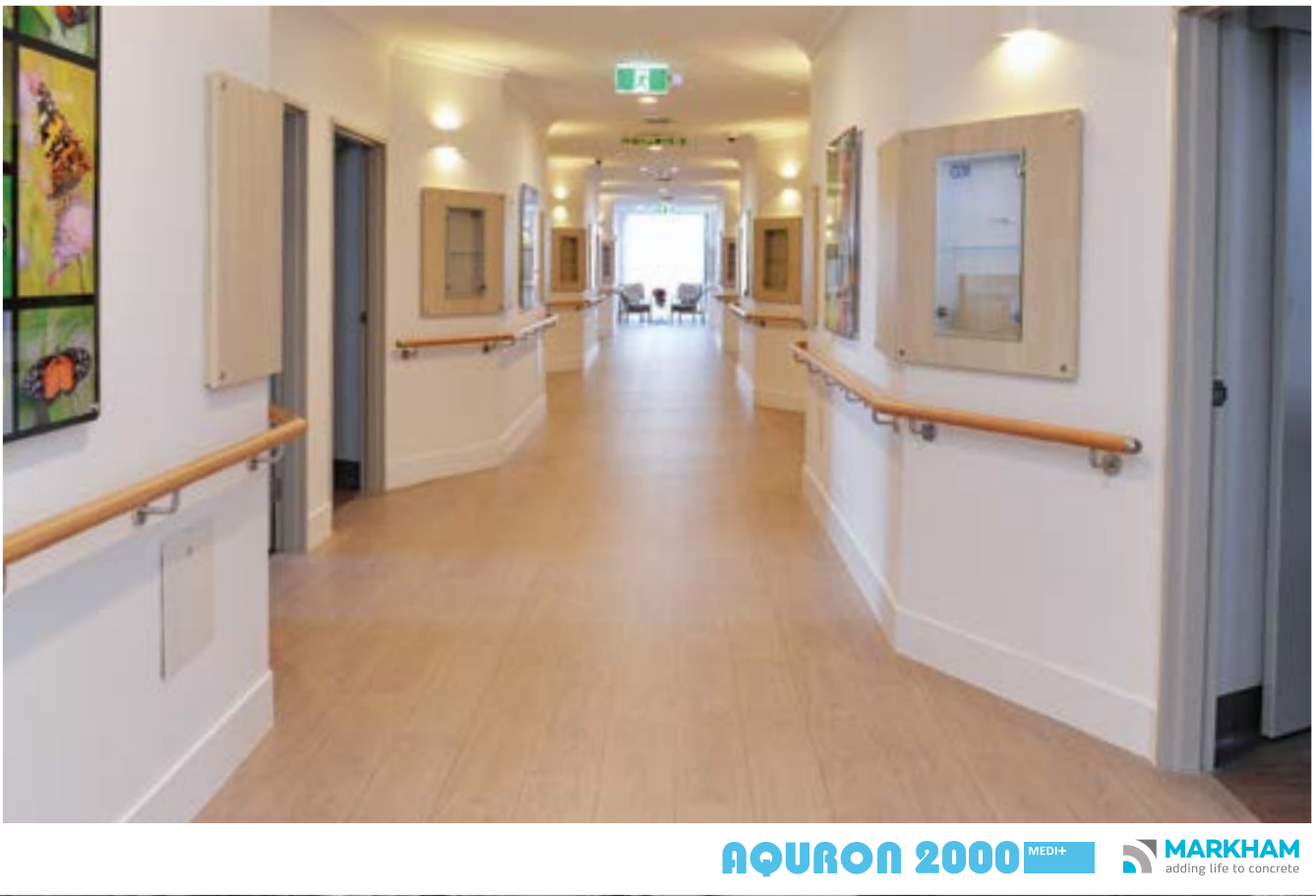
Below Markham Global applied their spray on hydrogel concrete sealer AQURON 2000 MEDI+ to Opal Aged Care Bathurst.