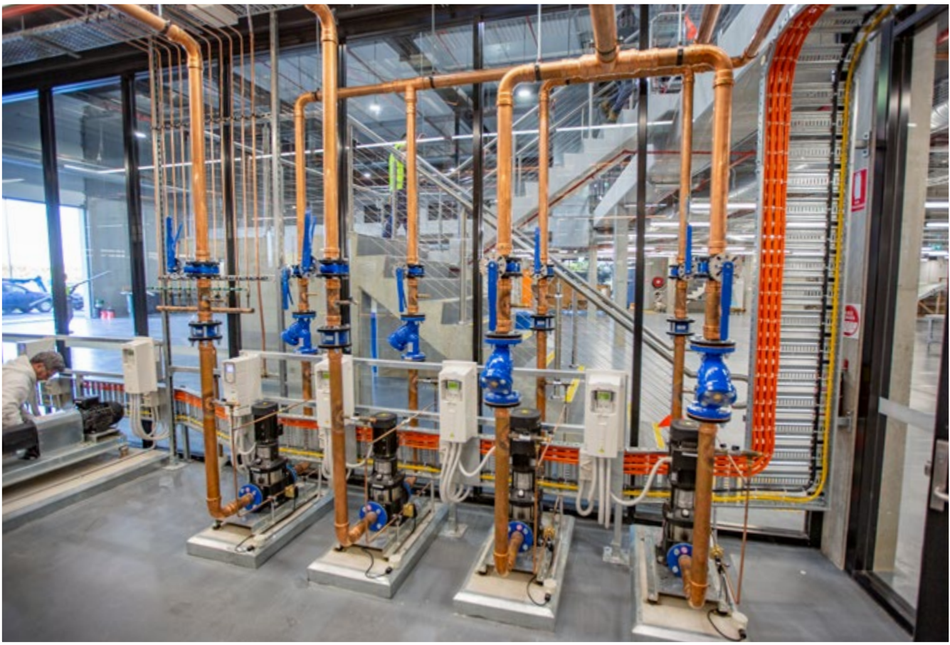
Below GeoExchange Australia designed, supplied and installed the ground source heat pump (GSHP) system.