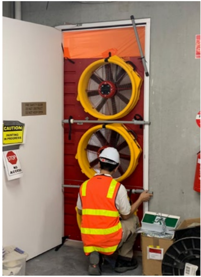
Below Efficiency Matrix ensured the building envelope is as airtight as possible to assure a net zero energy status.

Techniblock is Australia’s leading screw piling company specialising in screw piling, bored piers, underpinning and foundation repairs.