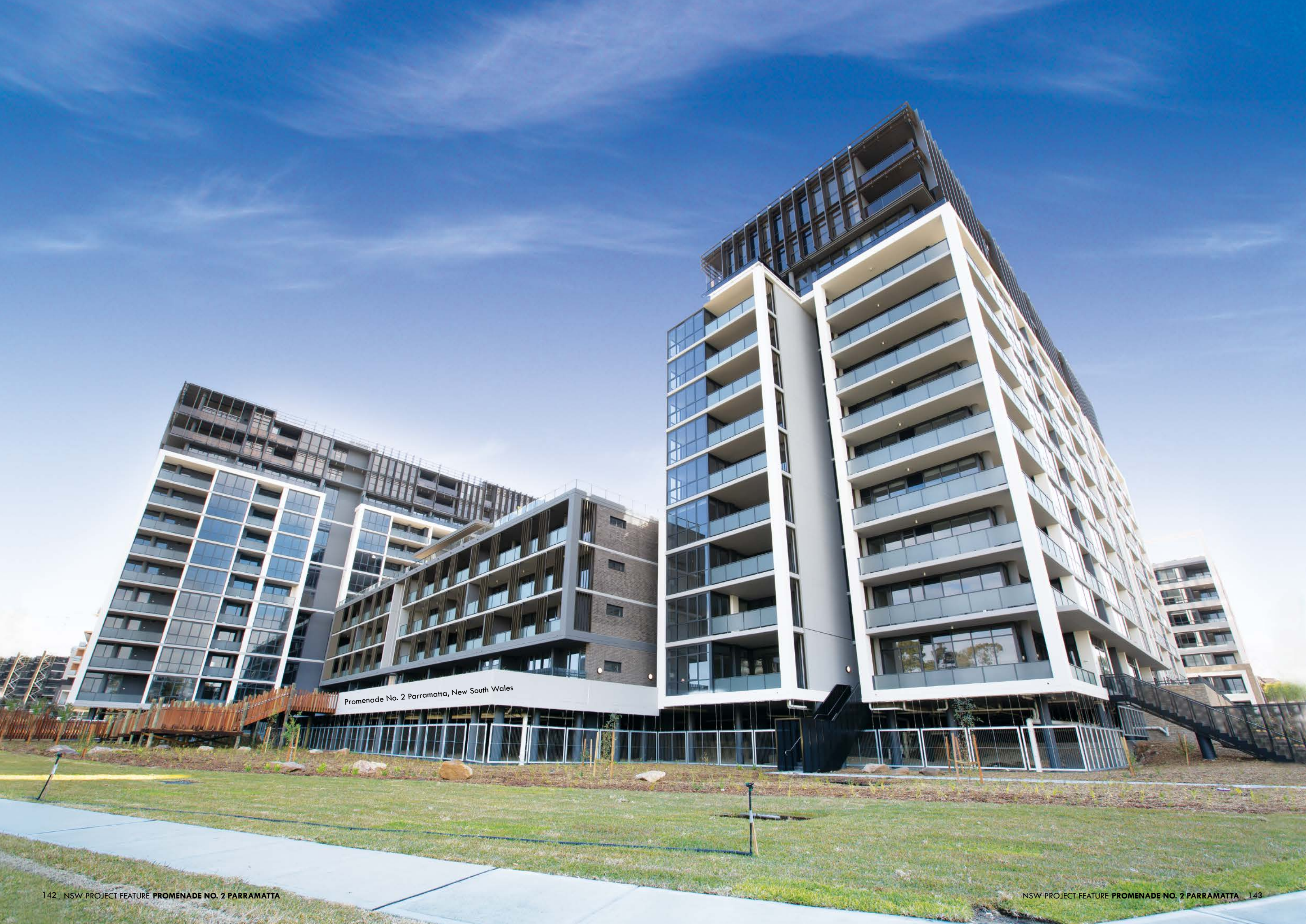
Promenade No. 2 Parramatta, New South Wales