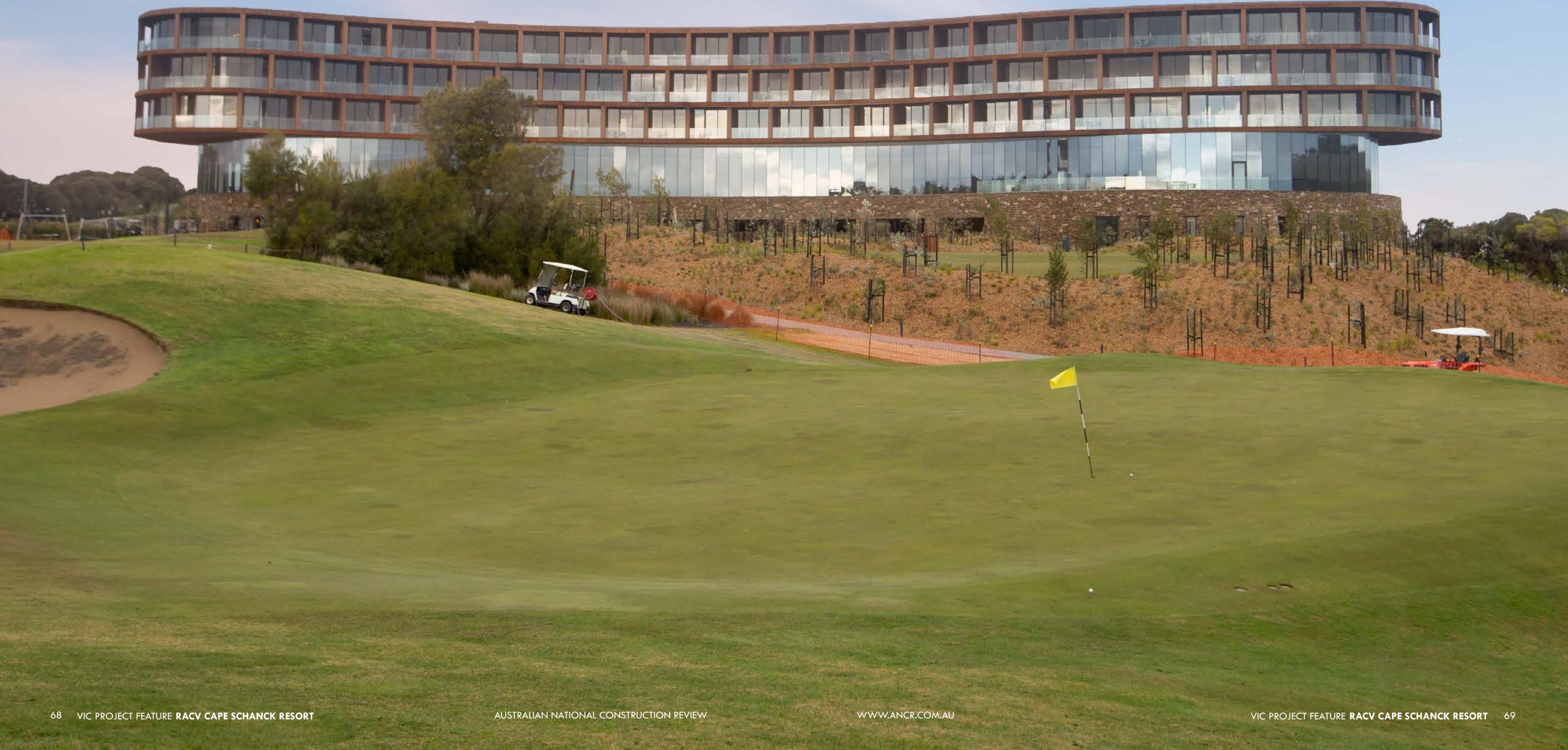
RACV Cape Schanck Resort, Victoria