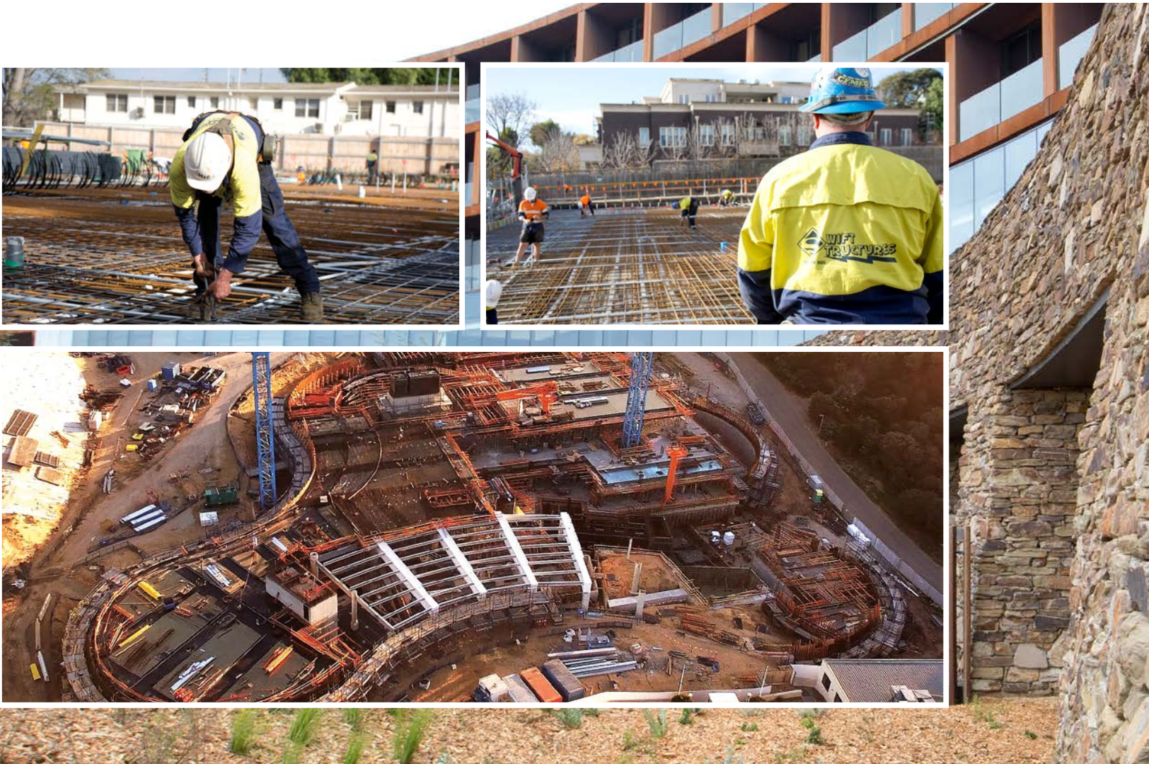
Below Swift Structures installed and fitted 3,600 tonnes of steel reinforcing for the RACV Cape Schanck Resort development.