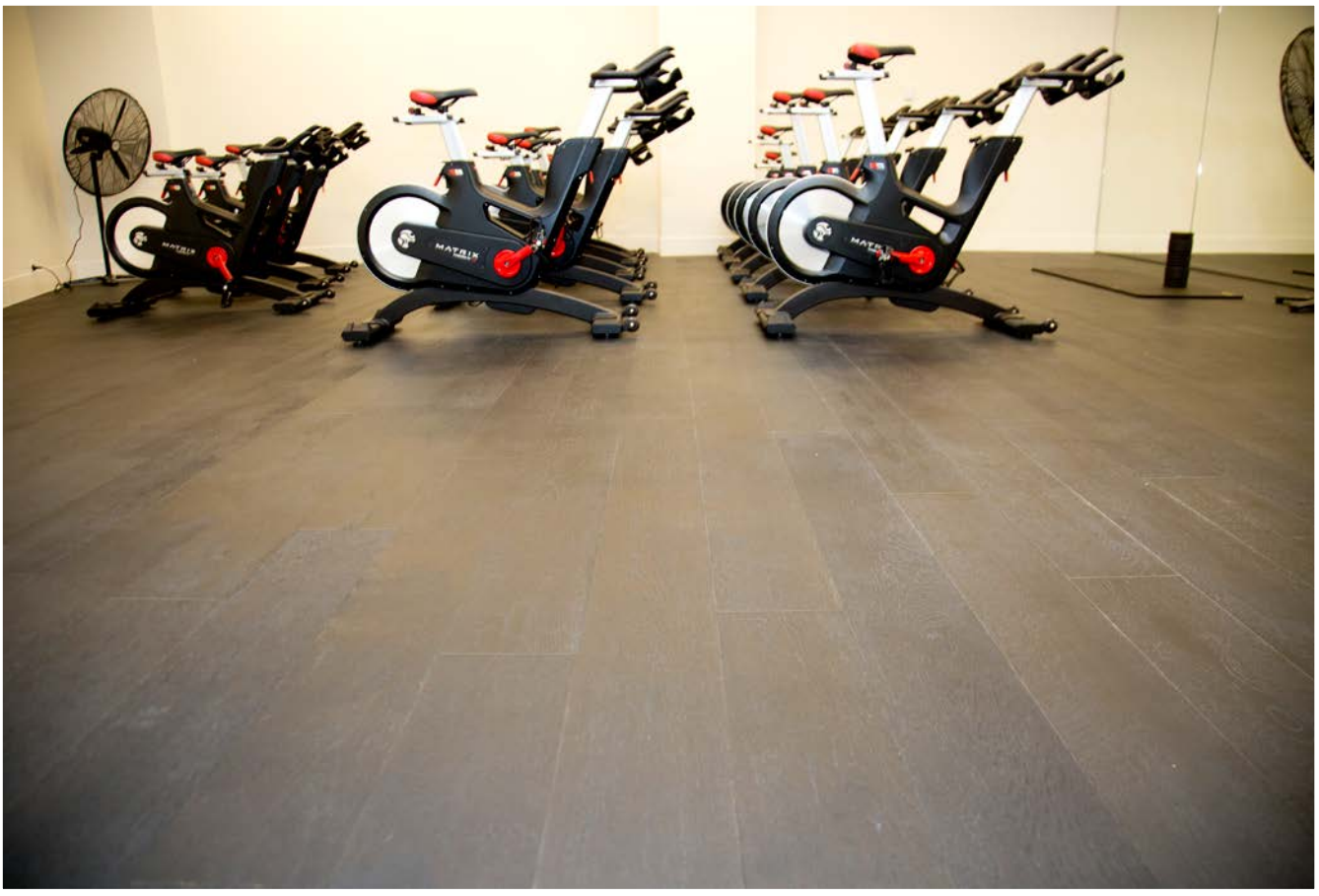
Below Kemellies Timber Flooring supplied 80m 2 of timber flooring to the ground floor gymnasium of the resort.