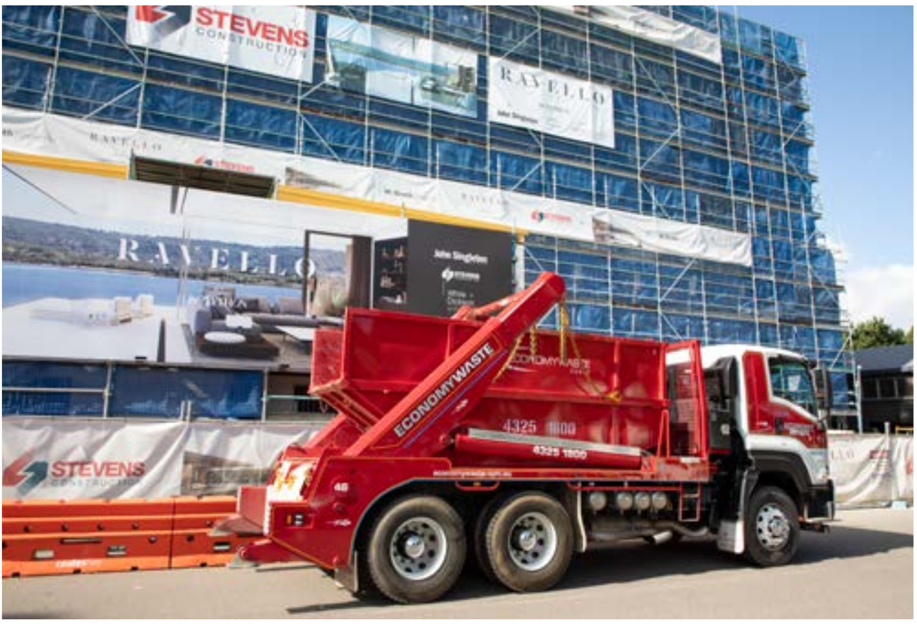
Below Economy Waste Group provided skip hire throughout the duration of the Ravello Residences construction. Below SKE Electrical supplied and installed architectural and feature lighting throughout the project to create a high end feel.