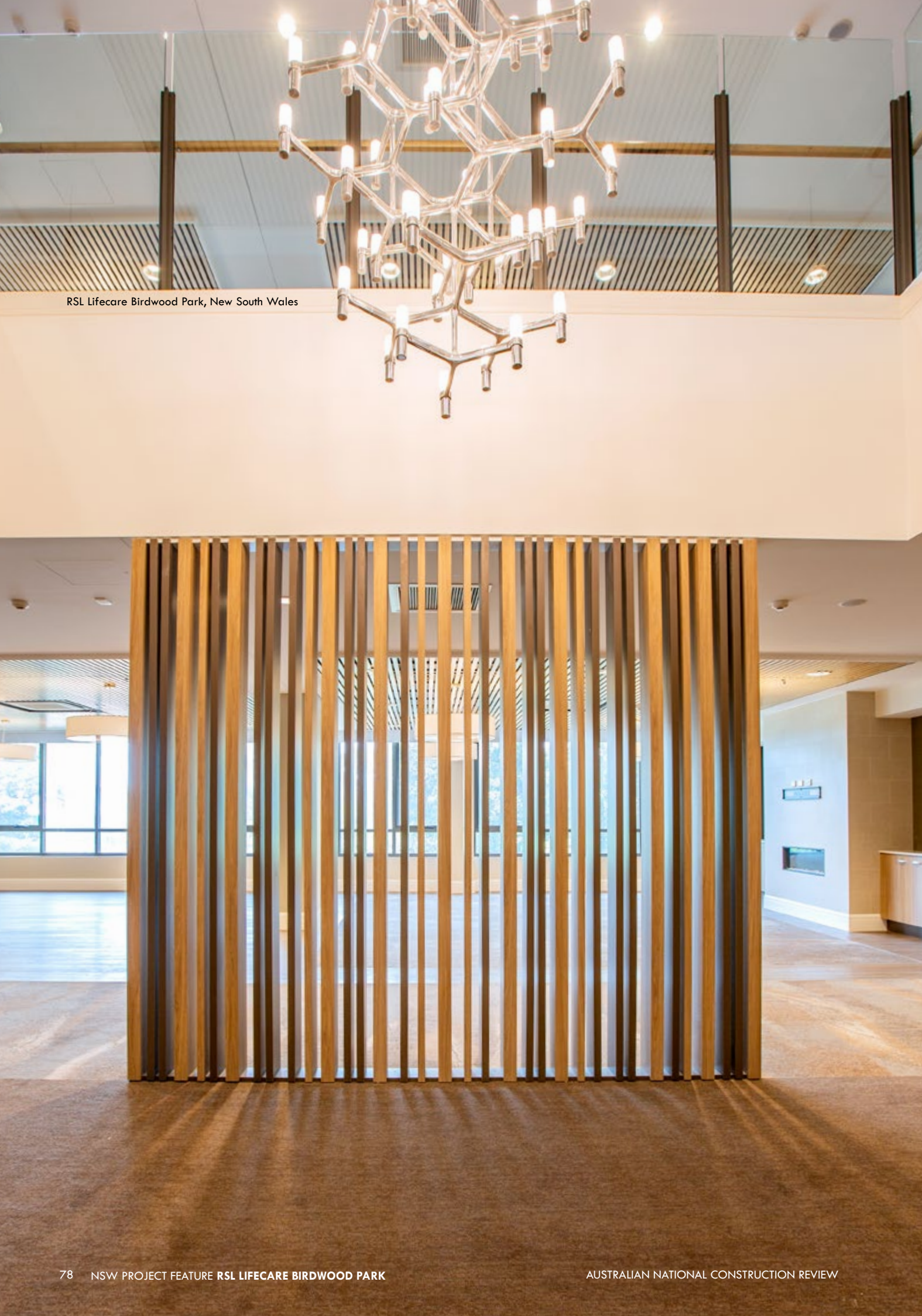
RSL Lifecare Birdwood Park, New South Wales