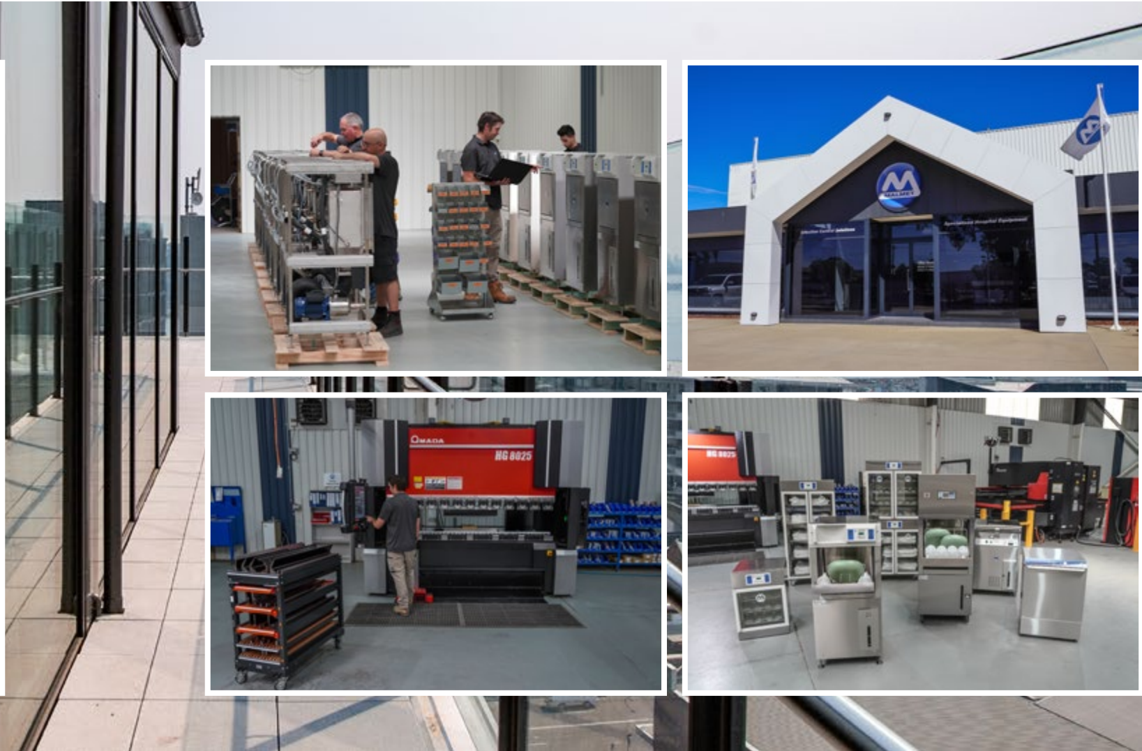
Below Malmet manufactured and supplied a range of disinfectors for utensils, bedpans and urinals.

Carter & Osborne Electrical is a leading electrical specialist with an exclusive focus on commercial and industrial projects including the health, education, aged care and retail sectors. Carter & Osborne’s track record and reputation resulted in their appointment as the electrical contractor for RSL Lifecare Birdwood Park.