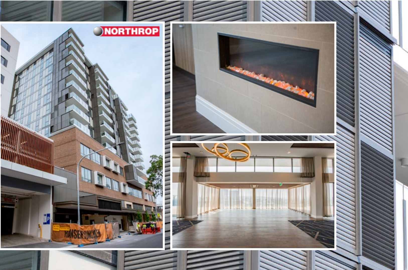
Below REMONDIS Australia carried out the disposal of 444 tonnes of demolition waste and 26 tonnes of dry waste.