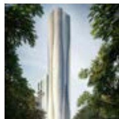
Aspire, Melbourne VIC