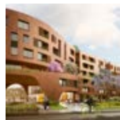
Arkadia, Alexandria NSW