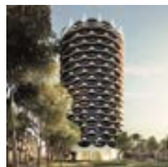
Banksia, Melbourne VIC