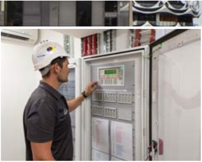
Below SRD Fire Protection completed the installation of the sprinkler system, fire pumps and extinguishers.