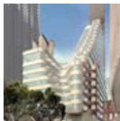
Bennetts Lane, Melbourne VIC