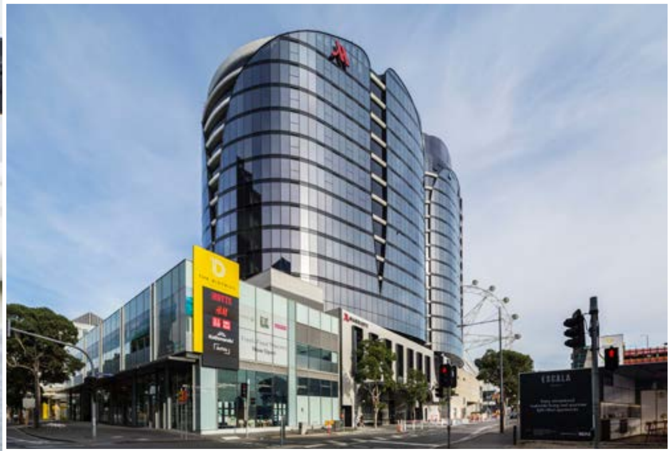
Below Fangda Australia manufactured the bespoke dark blue curved glass façade for the project.

SRD Fire Protection has strived to set the highest standards for the last 18 years and has equipped the Marriott Docklands with effective systems to ensure full compliance for the safety of hotel guests and residents alike. SRD specialises in commercial, industrial and residential sprinkler systems, fire hydrants and hose reels, warning and detection systems offering a complete fire protection package to their clients.