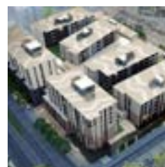
Caulfield Village, Caulfield VIC